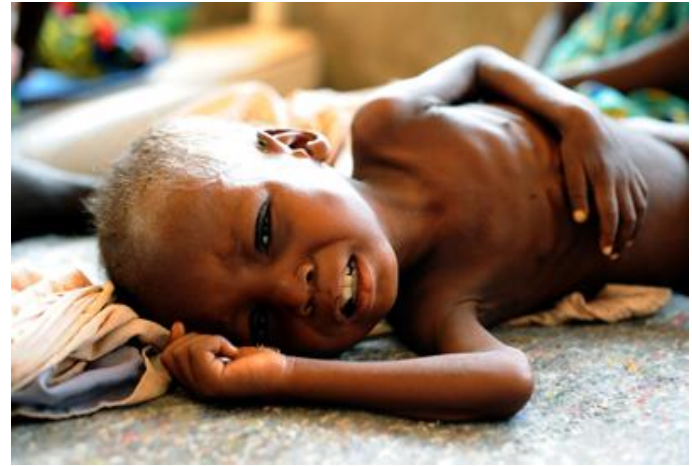
Save the Children Fund, 2013

“How we can possibly be giving £1bn a month, when we're in this sort of debt, to Bongo Bongo Land is completely beyond me ... To buy Ray-Ban sunglasses, apartments in Paris, Ferraris and all the rest of it that goes with most of the foreign aid. F18s for Pakistan. We need a new squadron of F18s. Who's got the squadrons? Pakistan, where we send the money.” Godfrey Bloom, MEP, July 2013